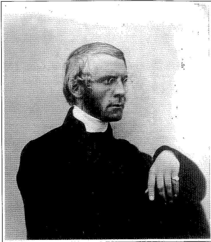
Bishop John W. Colenso