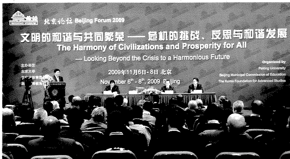
The Closing Ceremony of Beijing Forum 2009